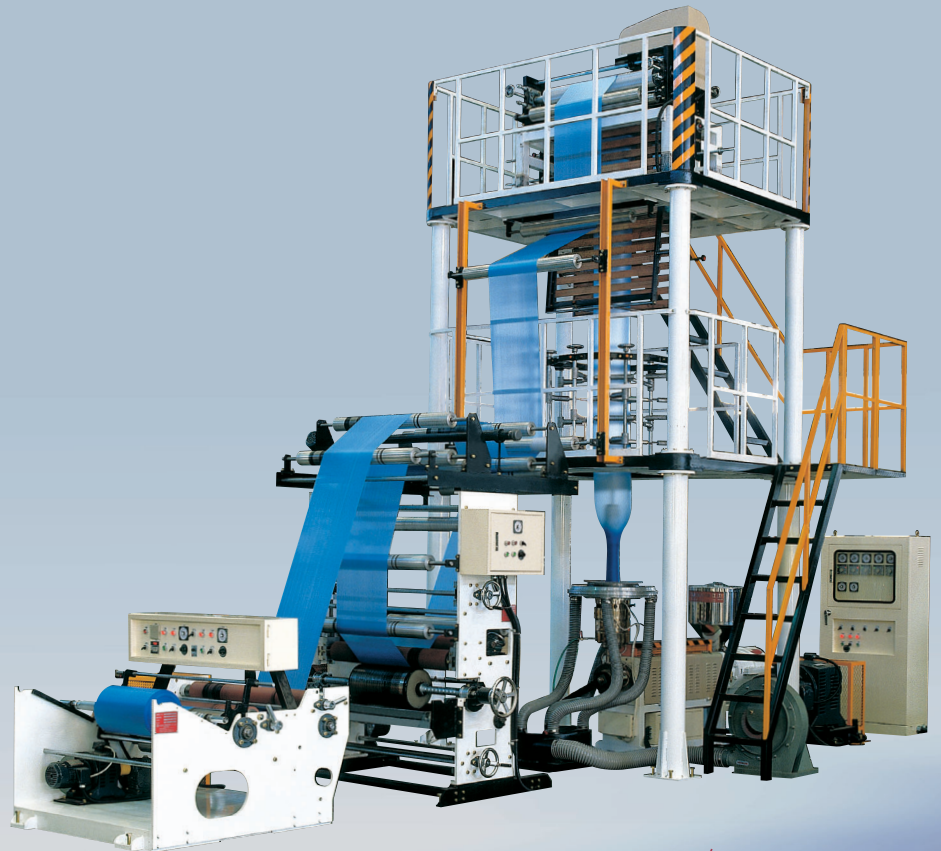
MODEL : YJF-PT1 - Ø60/1200L